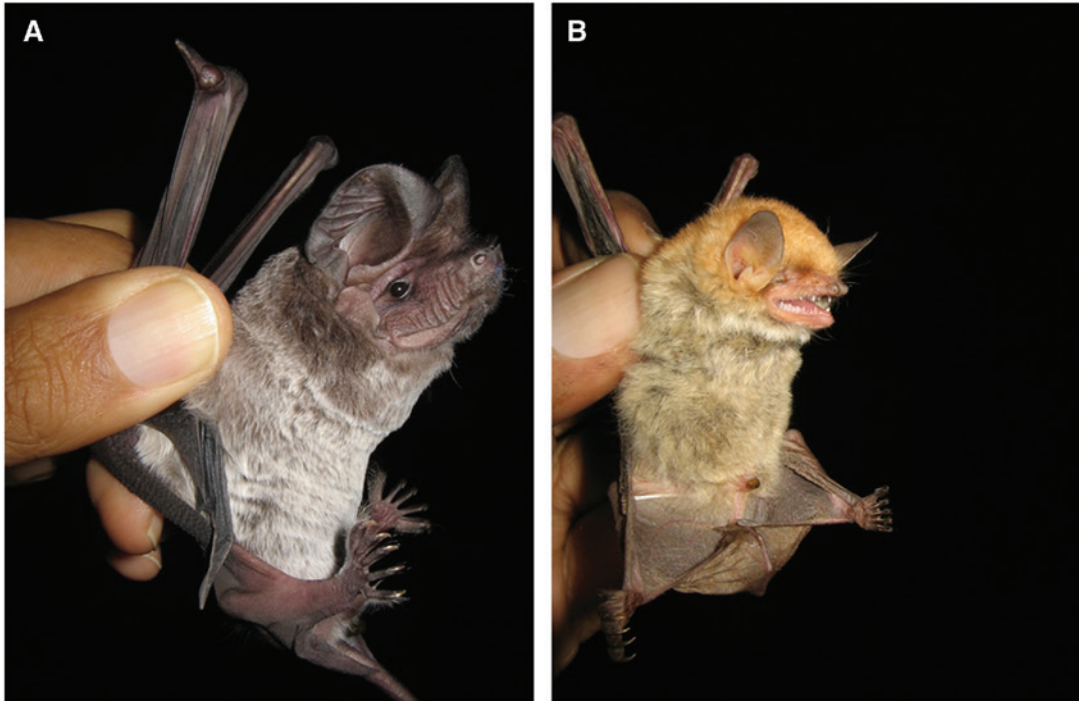
Figure 2: Photographs of the specimens of the two species recorded from new localities in Swaziland: (A) Mops midas (DM 14563), (B) Myotis bocagii (DM 13644).

Myotis bocagii is widely but patchily distributed in sub-Saharan Africa, being mostly associated with riverine habitats in forest and savanna zones (Rosevear 1965, Monadjem and Fahr 2007, Happold 2013). In the forest zone, it is frequently associated with banana plants where it has been captured roosting during the day in furred banana leaves (Rosevear 1965, Monadjem and Fahr 2007), but may also roost in palms of the genus Hyphaene , as well as in hollow trees (Happold 2013). Its roosting sites in the savanna zone are not known, but it is closely tied to open water bodies where it trawls for insects (Happold 2013). The records from Swaziland are not surprising since the species has been recorded from Kruger National Park to the north and Mkhuzo Game Reserve and Krantzklouf Nature Reserve to the south (Monadjem et al. 2010a). However, the distribution and habitat preferences of this species are still poorly known south of the Limpopo River, and the species has yet to be recorded in southern Mozambique (Monadjem et al. 2010b) to the east of Swaziland.